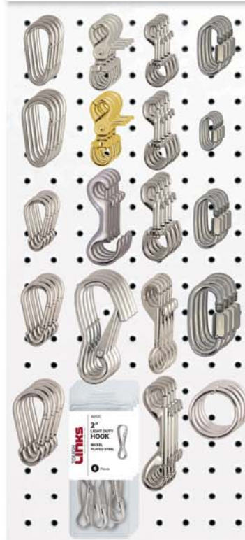
#34043L 20 sku's, 100 pcs. 9" (w) x 20" (h)