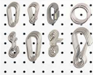
#34042L 8 sku's, 40 pcs. 9" (w) x 8" (h)