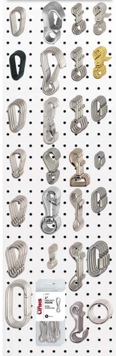
#34041L 28 sku's, 140 pcs. 9" (w) x 30" (h)